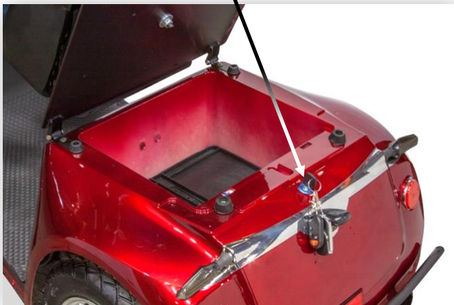
Insert Key into Trunk Lock