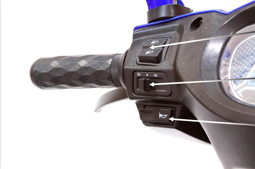
LEFT SIDE CONTROLS