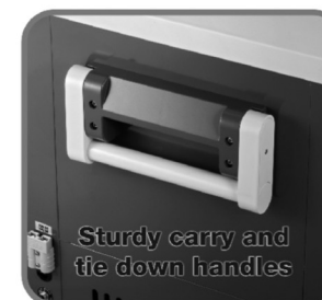
Sturdy carry and tie down handles