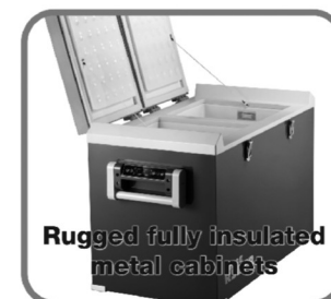
Rugged fully insulated metal cabinets