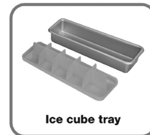
Ice cube tray