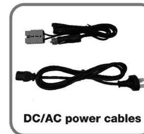
DC/AC power cables