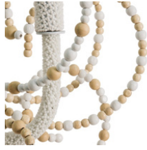
Natural / White