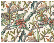
Pangolin Park Chalk Linen