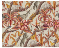
Pangolin Park Plum Velvet or Linen