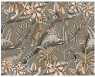
Pangolin Park Silver Velvet