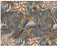
Pangolin Park Ash Velvet or Linen