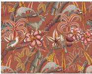
Pangolin Park Rust Velvet