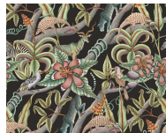
Pangolin Park Night Velvet or Linen