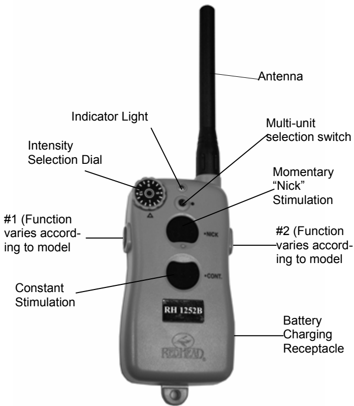
Transmitter (RH 1252B shown)