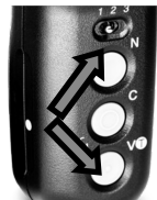
FIG. 1 Press & Hold N & V/T at same time

To select Vibrate or Tone : 1.) Press and Hold the (N) button and the V/T button at the same time. (See FIG. 1) 2.) Look for the LED light on the top of the remote to change to blinking: Red (for Vibration) OR: Green (for Tone) (See FIG. 2) 3.) Release the buttons when the light is blinking: Red for Vibration Green for Tone