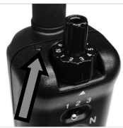
FIG. 2 –LED light will blink Red=Vibe Green=Tone