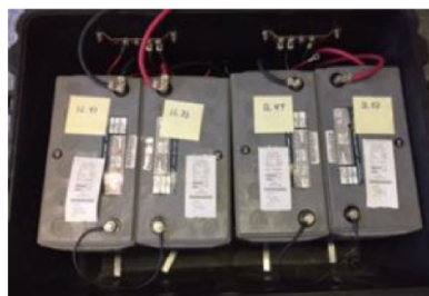
Deka Unigy 12V Model 31HR5000