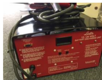
Lester 12/24 Battery Discharge Unit