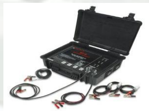
SC-6 Charger NSN: 6130-01-694-3664