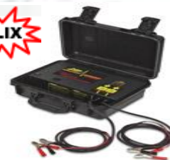
Dual 24V Charger NSN: 6130-01-609-9818