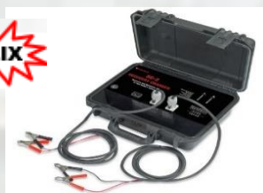
SC-2 Charger NSN: 6130-01-689-4211