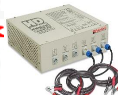
Pro-PC-6 Charger NSN: 6130-01-670-6729