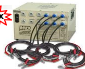
Pro-PC-12 Charger NSN: 6130-01-670-6428