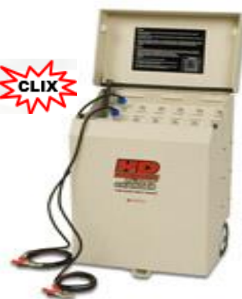
Pallet Charger NSN 6130-01-532-7711