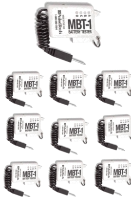
Mini Battery Load Tester