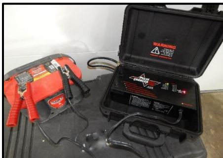
Example: 12V World Charger in use.

The 12V World Charger is a single channel, 12V, 16 amp (20A peak) charger. It uses universal electrical input (110Vac – 250Vac) . The charger can be connected to any type or size of 12V lead acid battery (AGM, GEL or flooded cell).