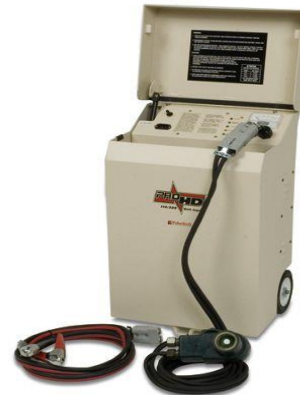
Pro-HD 12/24V Charger