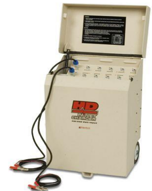
HD Pallet Charger