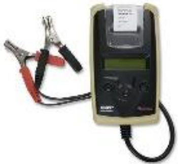
490PT+ Battery Analyzer