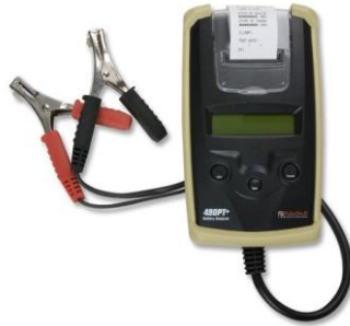
490PT+ Battery Analyzer NSN 6130-01-510-9594 Part # 741x491

NAVY: TM 17-15 BAD-1 Authorized This tester costs less than most batteries!