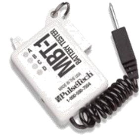
Mini Battery Load Tester NSN: 6625-01-463-8499 Part # 741x800 - Army CLIX

The MBT-1 makes checking for good and bad 12-Volt lead-acid batteries quick and easy. This weather resistant, mini battery load tester is small enough to slip in a pocket. It's simple to use with a fixed post positive connector and a coil-corded moveable negative connector. Easy to read color coded LEDs. Reverse polarity and over voltage protected