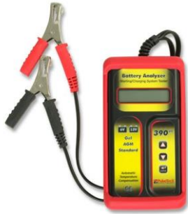
390PT Battery Analyzer NSN 6130-01-580-3882 Part # 741x390 - Army CLIX

NAVY: TM 17-15 BAD-1 Authorized This tester costs less than most batteries!