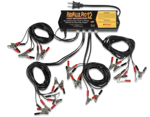
Pro-12 Battery Maintainer