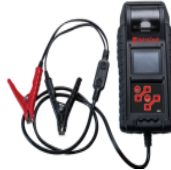
890PT Battery Analyzer NSN Pending NEW: Part # 741x890

Army: Standard on all SATS USMC: LABM / TAMCN: K0022 AF: TO 1-1A-15 Authorized