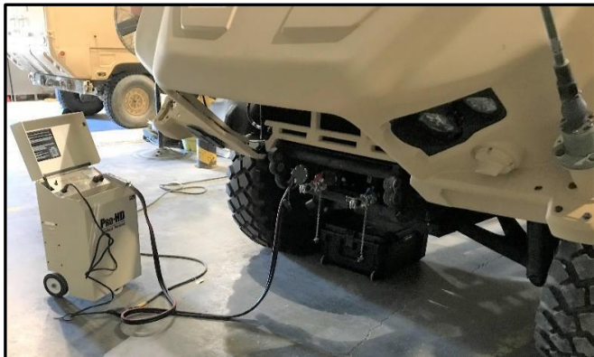
Example: Pro-HD Charger servicing the primary batteries on a JLTV.

The Pro-HD is an auto sensing 12/24V, 50 Amp charger designed to charge any type of lead acid battery (AGM, GEL, or flooded cell) using the supplied clamps or NATO connector. It uses universal electrical input (110Vac – 250Vac). Smart charging with one-switch operation minimizes operator training requirements.