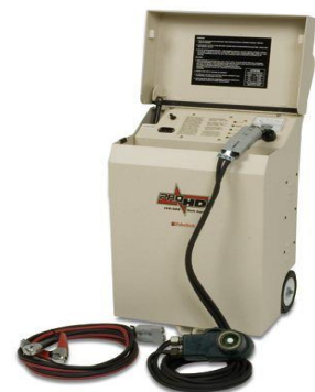
*ProHD Charger 12 / 24 V Charger Part# 746X800 NSN 6130-01-500-3401 Repairable at Unit level

*Both these solar applications include installation kits.