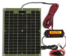
24VDC Pulse Solar Charger Part# 735X640 NSN 6130-01-487-0035 12VDC Pulse Solar Charger Part# 735X740 *NSN 6130-01-546-8432

*Both these solar applications include installation kits.