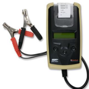
490PT+ Diagnostic Tester 12V Conductance Tester Part# 741X491 NSN 6130-01-510-9594 Replacement Thermal Paper: Part# 741X024 NSN 7530-01-357-6852.