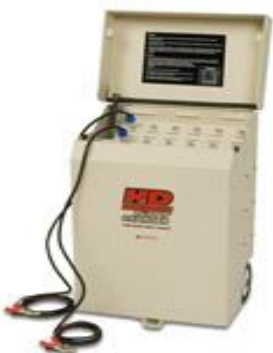
Pallet Charger 12V, 12 Station Charger Part# 746X820 NSN 6130-01-532-7711 Repairable at Unit level

Did you know that the AF AGE TO 1-1A-15 was updated to include multiple pieces of PulseTech equipment, which you are now authorized to utilize for your battery maintenance program? TO 1-1A-15 update includes the following additions: