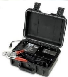
World Charger 12V Charger w/case Part# 746X725 NSN 6130-01-477-4703