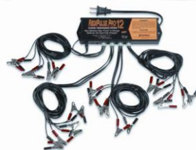
Pro-12 Maintainer 12V – 12 Station Maintainer Part# 746X912 NSN 6130-01-535-2718

In each Newsletter we will break down the capabilities of one of the items listed in the TO and try to address some pertinent information. This Newsletter we will focus on the Pallet Charger and address how to read the date of manufacture on an Optima battery (this is not as straight forward as you would think), see page 2 for details.