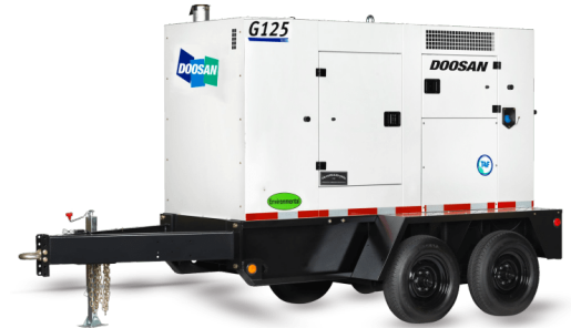
DOOSAN Portable Power

These popular industry brands use PulseTech Products to ensure that their equipment starts when needed, by keeping their batteries fully charged at all times. This could be in support of emergency response to natural disasters or anywhere power is needed to provide service or to get the job done!