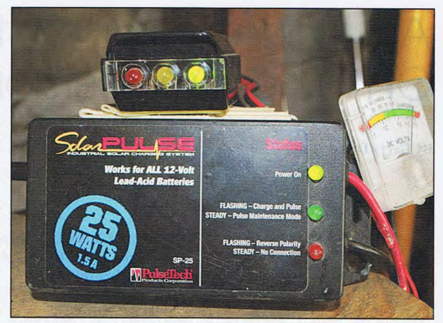
Photo H. The new QuadLink Battery Charger Splitter from Pulse Tech allows charging up to four batteries from one battery charger - one at a time, automatically. The QuadLink gives each battery connected a 10-minute charge before rotating to the next battery in line.

If you want to allow a certain battery to have more relative charge time within