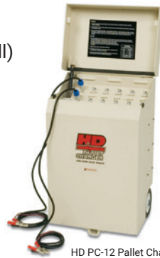
HD PC-12 Pallet Charger Part# 746X820 NSN: 6130-01-532-7711