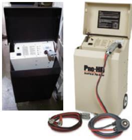
PRO-HD Charger Part #: 746X800 NSN: 6130-01-500-3401

PRO-HD REV-E Recovery Charger Upgrade Insert Part #: 740X831 Model #: PRO-HD REV-E NSN: 6130-01-645-5003