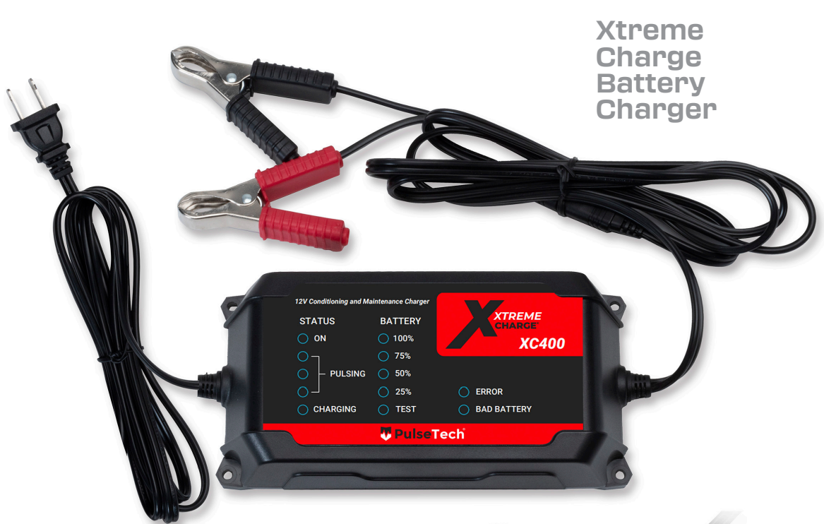
Xtreme Charge Battery Charger