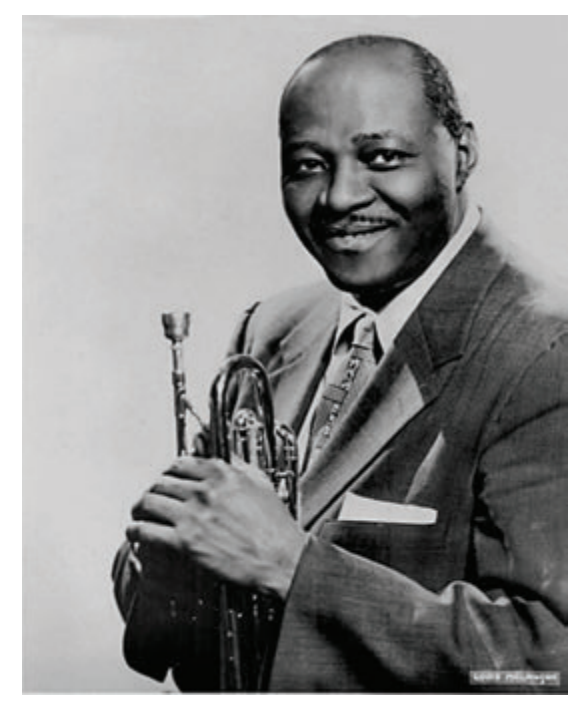
WILBUR de PARIS