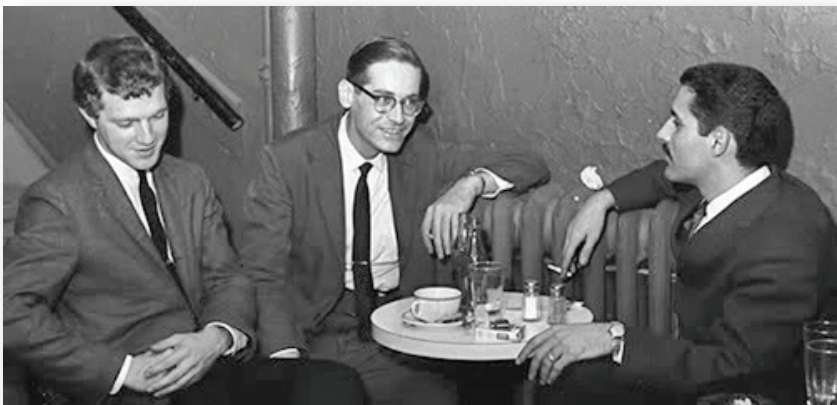
The Bill Evans Trio Scott LoFaro - Bill Evans - Paul Motian