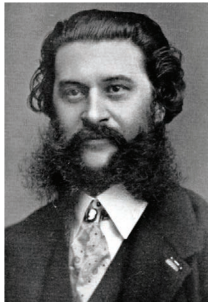
JOHANN STRAUSS II