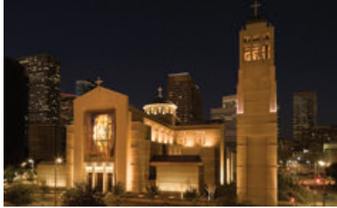
The Co-Cathedral of the Sacred Heart, Houston Texas

The Many Moods of Christmas is a collection of eighteen traditional Christmas carols selected by conductor Robert Shaw and arranged into four suites for chorus and symphony orchestra by Robert Russell Bennett, originally for a 1963 RCA Victor record album of the same name. This performance by the Houston Masterworks Chorus in Houston's Co-Cathedral of the Sacred Heart features a version for full chorus and instrumental ensemble comprising organ, piano and percussion. Two "bonus" selections were included in the concert: O Holy Night, for trumpet and piano; and an organ chorale prelude by J. S. Bach, Liebster Jesu, wir sind hier ("Dearest Jesus, we are here").