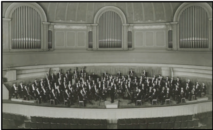
Fritz Reiner / Chicago Symphony Orchestra