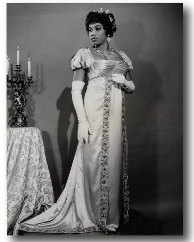
Leontyne Price as Tosca