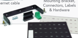
Mounting Bracket, Connectors, Labels & Hardware