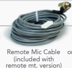
Remote Mic Cable (included with remote mt. version)