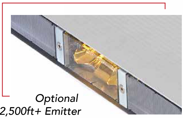
Optional 2,500ft+ Emitter