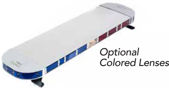
Optional Colored Lenses