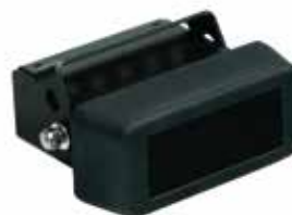
Visible Light Filter (VLF) Installed