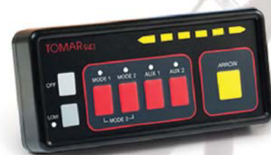
943-SB Controller Available Separately