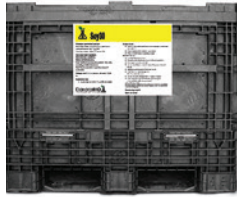
Bio Barge treats 43,200 u