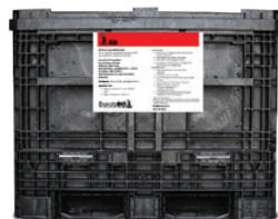
Bio Barge treats 1,320 acres