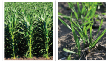
All crops benefit from the increase in biologically fixed nitrogen.