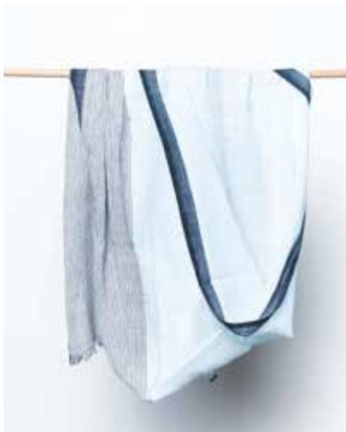
HAIKU ORGANIC COTTON SCARF - BLUE C304-BLU