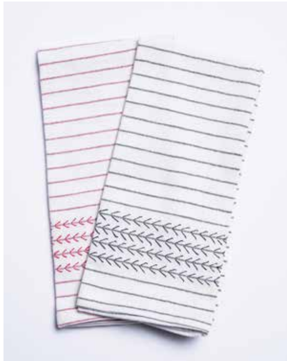
LILY KITCHEN TOWELS (SET OF 2) BLACK K301-BLK BURGUNDY K301-BUR