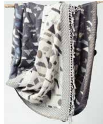
SLATE JACQUARD THROW H201