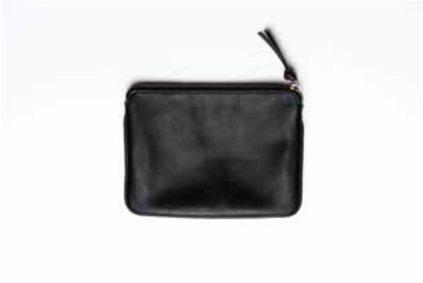
ZOE POUCH - BLACK B306-BLK