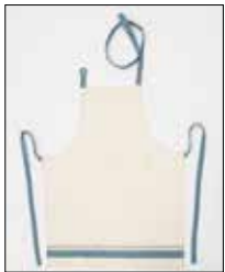
K311-BLU K311-BRO K311-RED K311-BLK $18