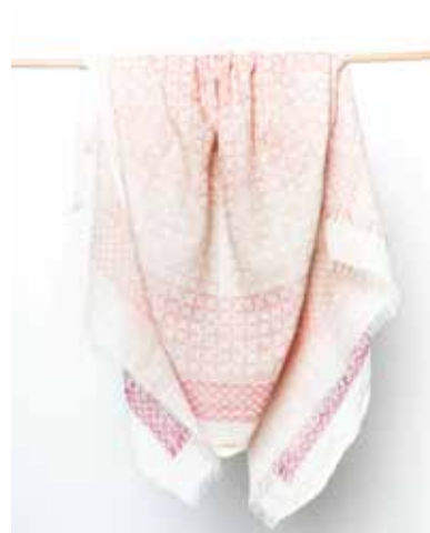
RITA COTTON SCARF - ROSE C302-ROS