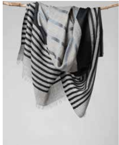
BELLA WOOLEN SCARF - GRAY W202-GRY