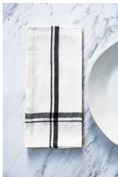
BLACK (SET OF 4) K211-BLK