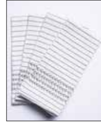
H302-BUR H302-BLK $19 (SET 4)