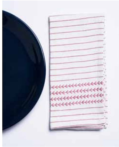
LILY NAPKINS BLACK (SET OF 4) K302-BLK