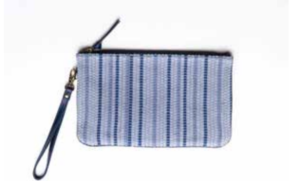
TORI WRISTLET CLUTCH - BLUE B303-BLU