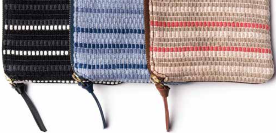
PALERMO POUCH - BLACK B304-BLK