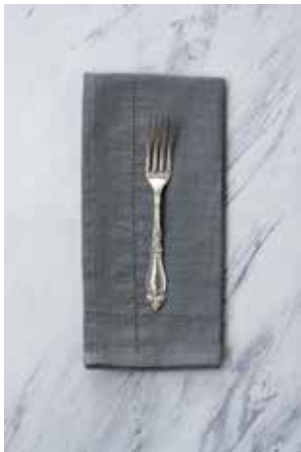
PICOT NAPKINS GRAY (SET OF 4) K212-GRY