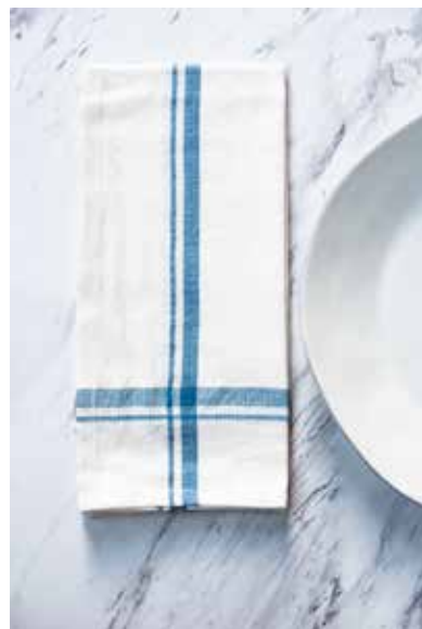
BLUE (SET OF 4) K211-BLU