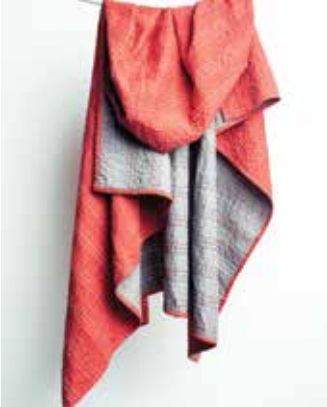
BARMER THROW RED H101-RED