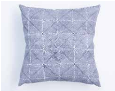
PRISM INDIGO PILLOW H224