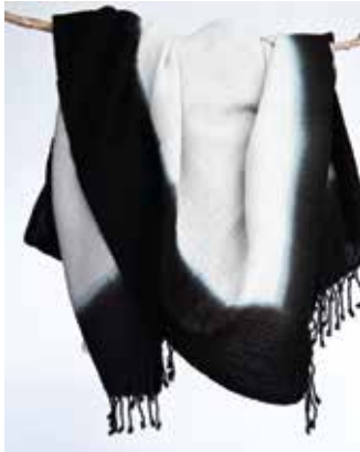
CLOUD WOOLEN THROW GRAY H202-GRY