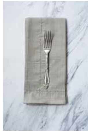
PICOT NAPKINS NATURAL (SET OF 4) K212-NAT