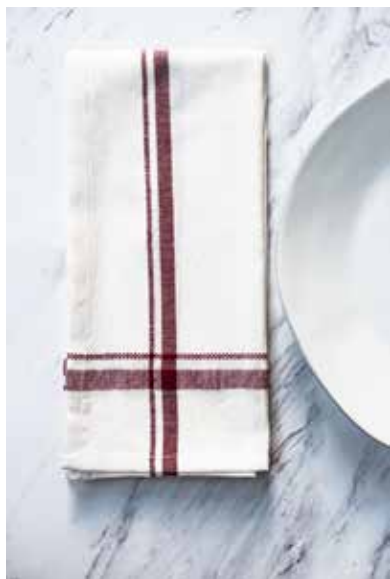
RED (SET OF 4) K211-RED