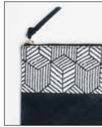
B112-BLK B112-SBL $15