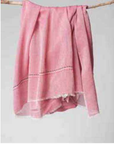
AGRA COTTON SCARF - PINK C113-RD