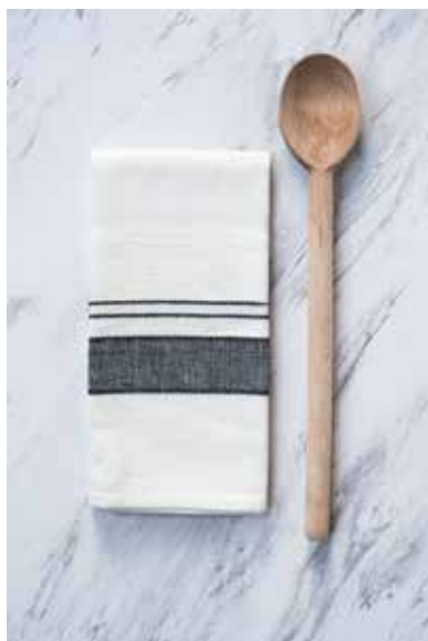
BLACK (SET OF 2) K201-BLK