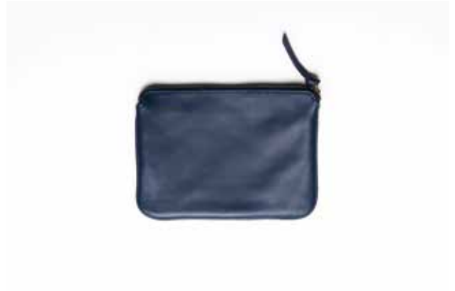
ZOE POUCH - BLUE B306-BLU