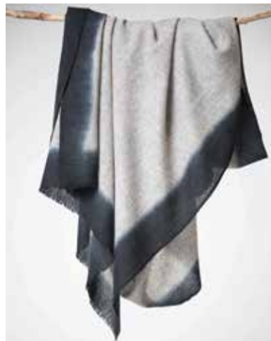
CASHMERE CLOUD SCARF - GRAY W205-GRY

70% CASHMERE 30% FINE MERINO 82 in. X 27 in.