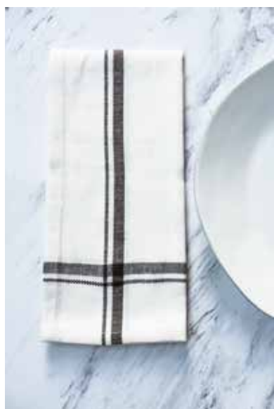
BROWN (SET OF 4) K211-BRO