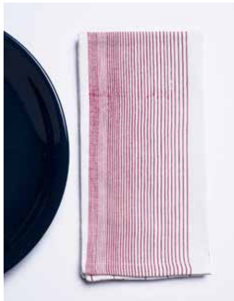
SOFIA NAPKINS BURGUNDY (SET OF 4) K304-BUR