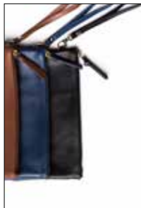
B305-BLK B305-BLU B305-TAN $37.50