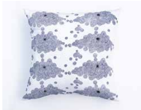
CLOUD INDIGO PILLOW H221