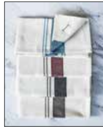
K201-BLU K201-RED K201-BLK K304-BRO $12 (SET 2)