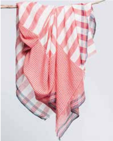
SAGAR COTTON SCARF - CORAL C114-RD