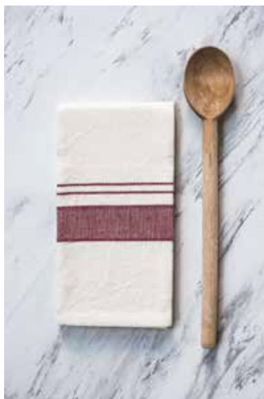
RED (SET OF 2) K201-RED