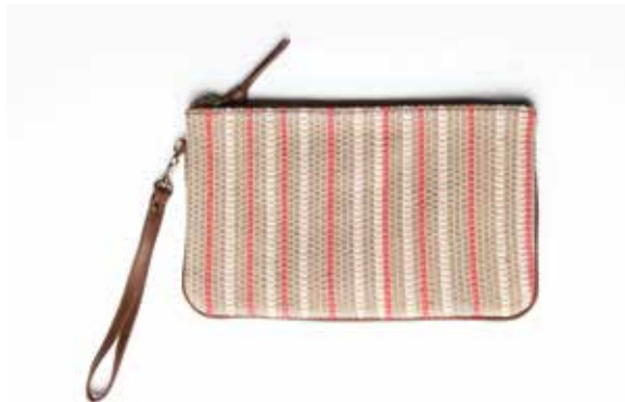
TORI WRISTLET CLUTCH - TAN B303-TAN

Outer: Cotton + Leather Cotton Lining, Inner Slit Pocket Zip Closure