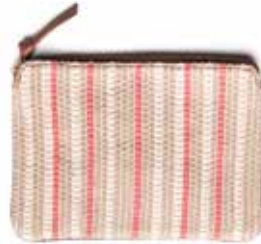
PALERMO POUCH - TAN B304-TAN

Outer: Cotton + Leather Cotton Lining Zip Closure