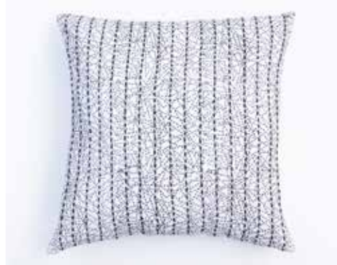
EDGE KANTHA PILLOW H222