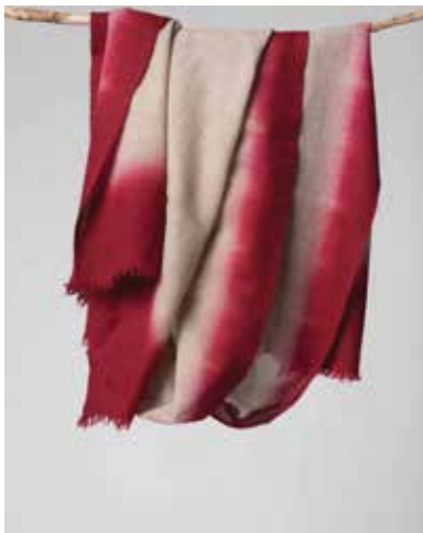
CASHMERE CLOUD SCARF - WINE W205-RED

Meet the finest and softest cashmere (pashmina) from Kashmir. At a whopping 4 oz., it's a perfect travel companion that easily fits into a purse or a pocket. Hand-woven in a traditional loom in the state of Kashmir by families that have been practicing the craft for generations. Dip-dyed by hand.