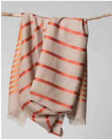
BELLA WOOLEN SCARF - CORAL W202-COR