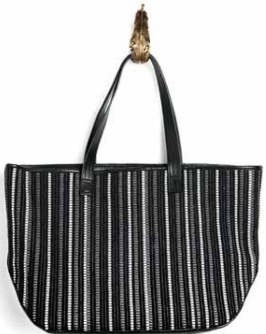
RIA TOTE - BLACK B301-BLK

Outer: Cotton + Leather Cotton Lining Inner Zip pocket / 2 Slit Pockets Outer Zip Closure 13"H x 21"W - Strap Drop: 9in.