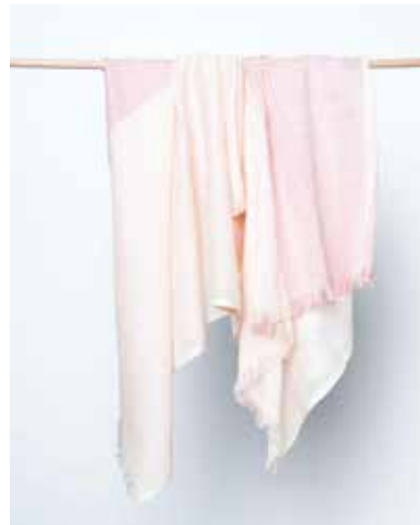
HAIKU ORGANIC COTTON SCARF - CORAL C304-COR