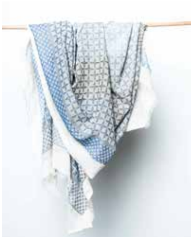
RITA COTTON SCARF - BLUE C302-BLU