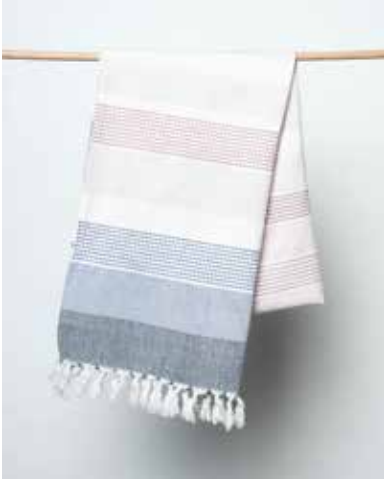
ADANA BEACH/PICNIC TOWEL BLUE H307-BLU