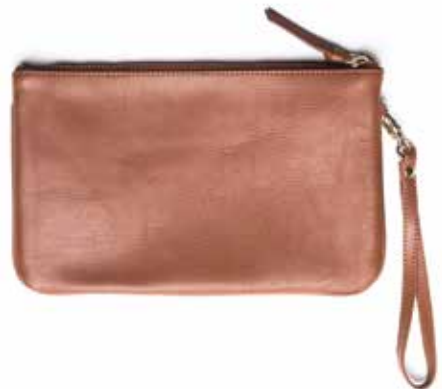
TERRA WRISTLET CLUTCH - TAN B305-TAN

Outer: 100% Leather Cotton Lining, Inner Slit Pocket Zip Closure Removable Leather Wrist Strap