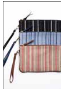
B303-BLK B303-BLU B303-TAN $30