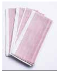
H304-BUR H304-BLK $18 (SET 4)