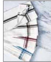
K211-BLK K211-BRO K211-RED K211-BLU $18 (SET 4)