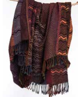
CHEVRON JACQUARD THROW H203