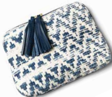
KAYA CLUTCH -SKY BLUE B111-SBL

Outer: Cotton + Leather Cotton Lining Zip Closure Inner Slit Pocket