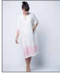
A301-PIN A301-BLU $32.50