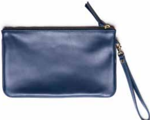
TERRA WRISTLET CLUTCH - BLUE B305-BLU