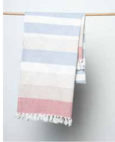
ADANA BEACH/PICNIC TOWEL ROSE H307-ROSE

100% HANDLOOMED COTTON SIZE 50in. X 72in.