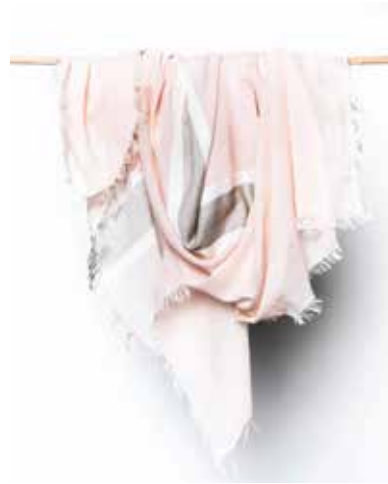
TRES COTTON SCARF - ROSE C301-ROS