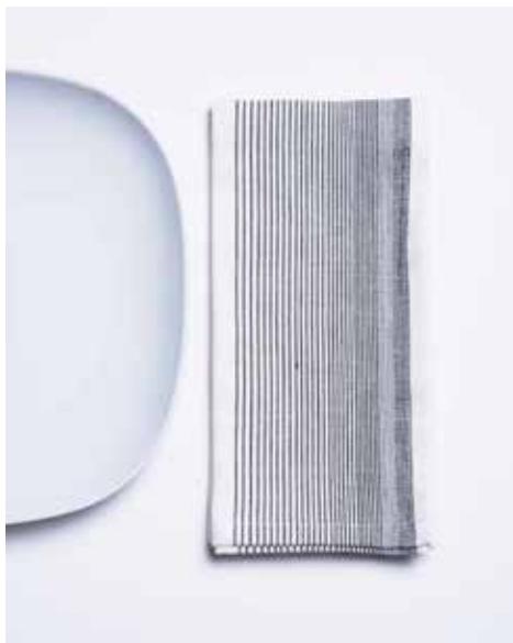
SOFIA NAPKINS BLACK (SET OF 4) K304-BLK