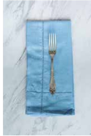
PICOT NAPKINS BLUE (SET OF 4) K212-BLU