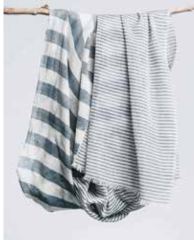
SAGAR COTTON SCARF - GRAY C114-GR