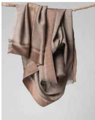
TRIBUTE WOOLEN SCARF - BROWN W204-BRO