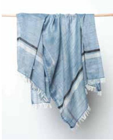
EVA COTTON SCARF - BLUE C303-BLU