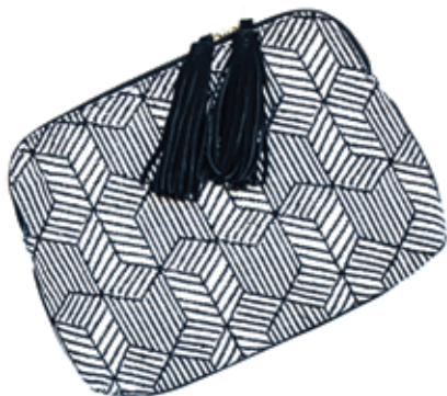
KAYA CLUTCH - BLACK B111-BLK