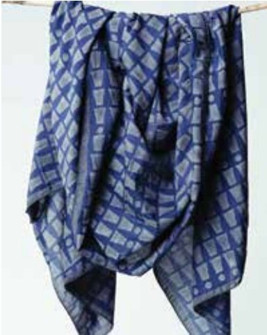
BARI NAVY SILK COTTON SCARF C201