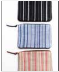
B304-BLK B304-BLU B304-TAN $20