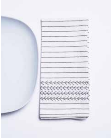
LILY NAPKINS BLACK (SET OF 4) K302-BLK