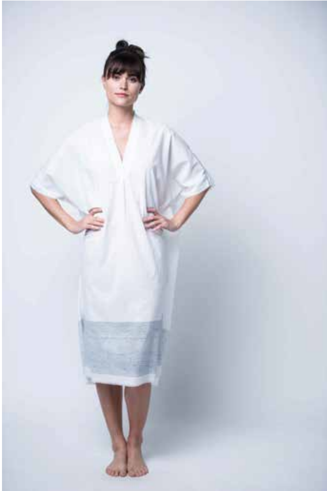
AMBAR KAFTAN - BLUE A301-BLU