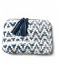
B111-SBL B111-BLK $20