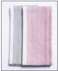
H303-BUR H303-BLK $12 (SET 2)