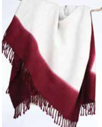
CLOUD WOOLEN THROW WINE H202-RED