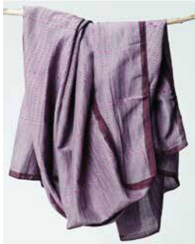
PAIMONA 2 SILK COTTON SCARF C203