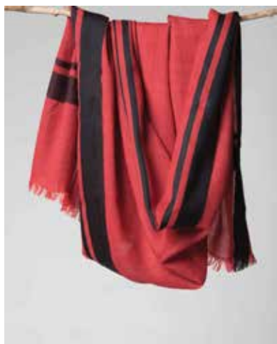
TRIBUTE WOOLEN SCARF - RED W204-RED