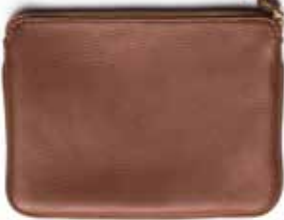
ZOE POUCH - TAN B306-TAN

Outer: 100% Leather Cotton Lining Zip Closure