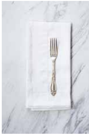
PICOT NAPKINS WHITE (SET OF 4) K212-WHT