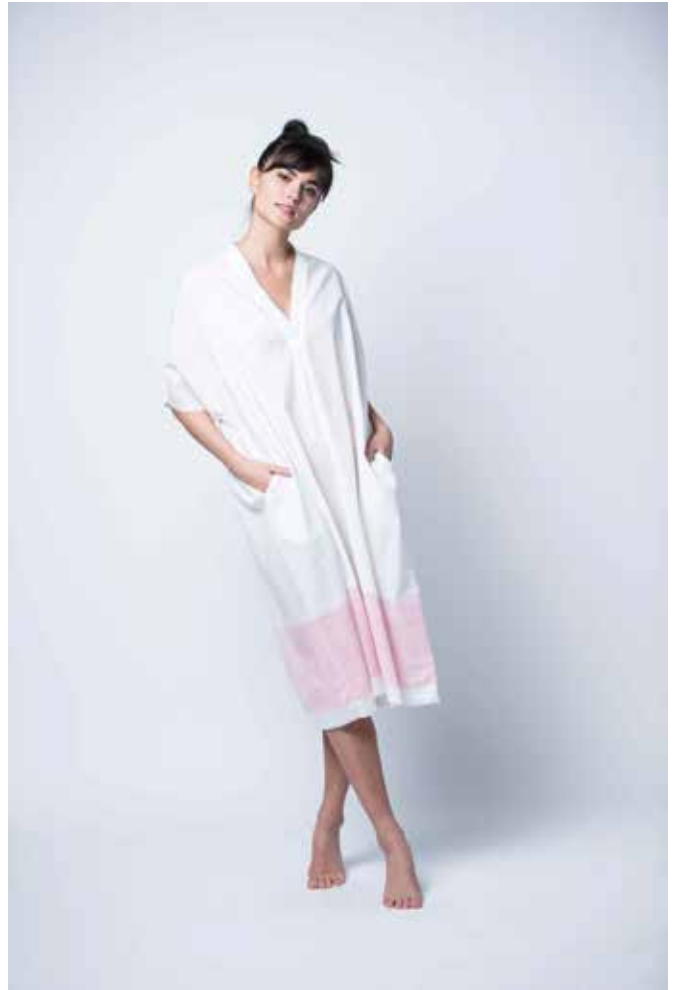
AMBAR KAFTAN - PINK A301-PIN

A single-size coverall with hand-block printed motifs and an elegant hand-stitched (Kantha) accent. 100% COTTON ONE SIZE