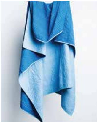
BARMER THROW BLUE H101-BLU