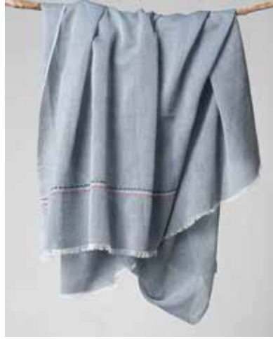
AGRA COTTON SCARF - BLUE C113-BL