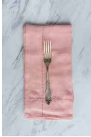
PICOT NAPKINS PINK (SET OF 4) K212-PIN