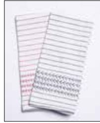
H301-BUR H301-BLK $14 (SET 2)