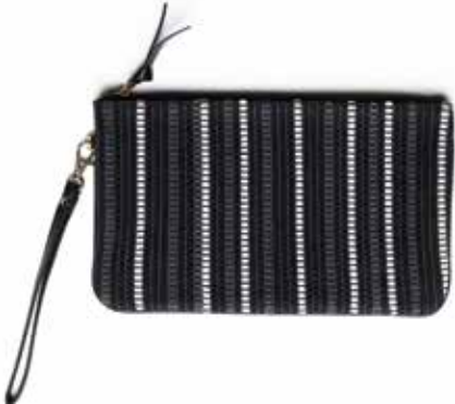
TORI WRISTLET CLUTCH - BLACK B303-BLK

Cute little bags with handloomed jacquard prints + soft natural leather and finished with a soft cotton lining. Use the Kina & Palermo as travel organizers, coin purses or make-up bags; the Kavya & Tori are perfect companion clutches to hold everyday essentials – keys, cash, lipstick, phone and more! Their attractive price make them perfect gifts!