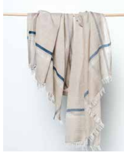
EVA COTTON SCARF - NATURAL C303-NAT