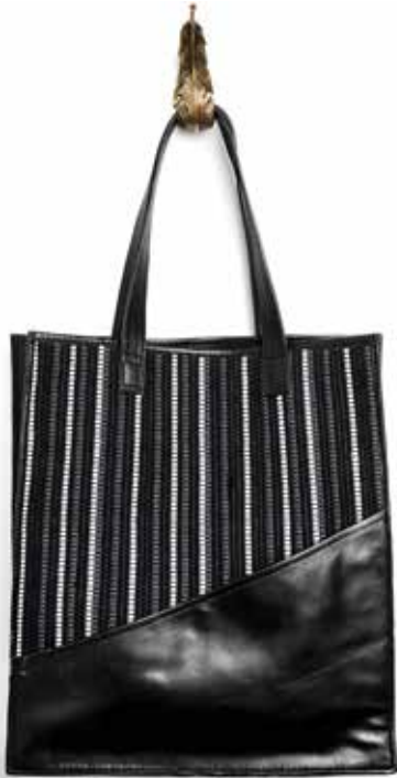
NADIA SHOPPER BAG - BLACK B301-BLK

Built to last, these totes are carefully handcrafted with lightweight handloomed cotton jacquard and natural leather. An ergonomic leather strap and lots of pockets make them versatile everyday companions.