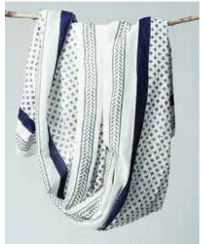
SANTORINI SILK COTTON SCARF C204