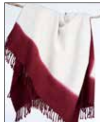
H202-RED H202-GRY $75