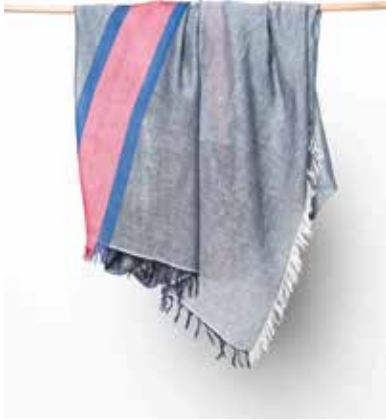
TRES COTTON SCARF - BLUE C301-BLU

Made of ultra-light cotton, these scarves get softer with every wash. Their clean design make them a versatile every-occasion accessories. Pre-washed.