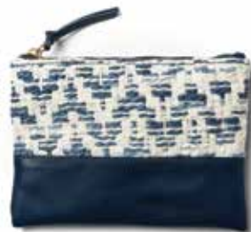
KINA COSMETIC BAG - SKY BLUE B112-SBL

Outer: Cotton + Leather Cotton Lining Zip Closure