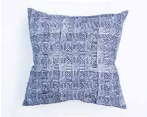
TEMPLE INDIGO PILLOW H223