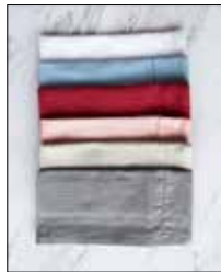
K212-WHT K212-BLU K212-RED K212-PIN K212-NAT K212-GRY $18 (SET 4)