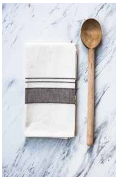
BROWN (SET OF 2) K201-BRO