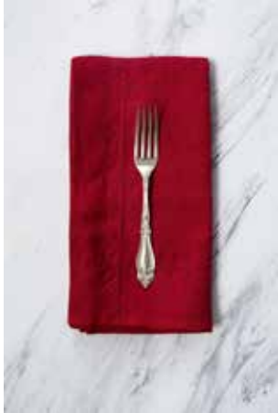
PICOT NAPKINS RED (SET OF 4) K212-RED