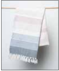
H307-BLU H307-ROS $37.50