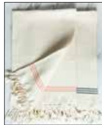
K202-RED K202-BLK $18 (SET 2)