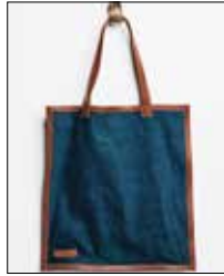
B109-DEN B109-KH $40