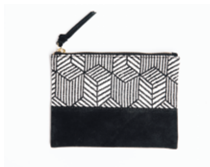
KINA COSMETIC BAG - BLACK B112-BLK