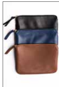
B306-BLK B306-BLU B306-TAN $24