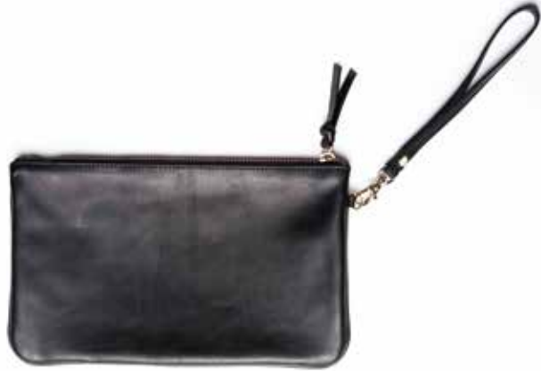
TERRA WRISTLET CLUTCH - BLACK B305-BLK

Minimalistic bags made with fine natural leather. Use the Terra as a versatile clutch; and the Zoe as a travel organizer or cosmetic bag.