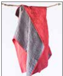
H101-RED H101-BLU $40