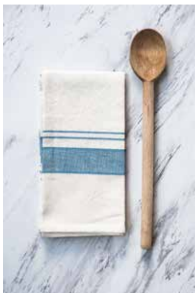
BLUE (SET OF 2) K201-BLU