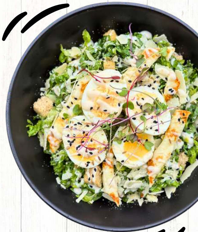
LEMON PEPPER CHICKEN SALAD