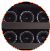
BLACK STAINLESS STEEL FRONT