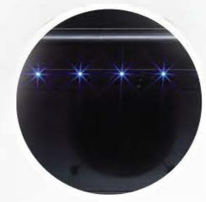
BLUE LED LIGHTING