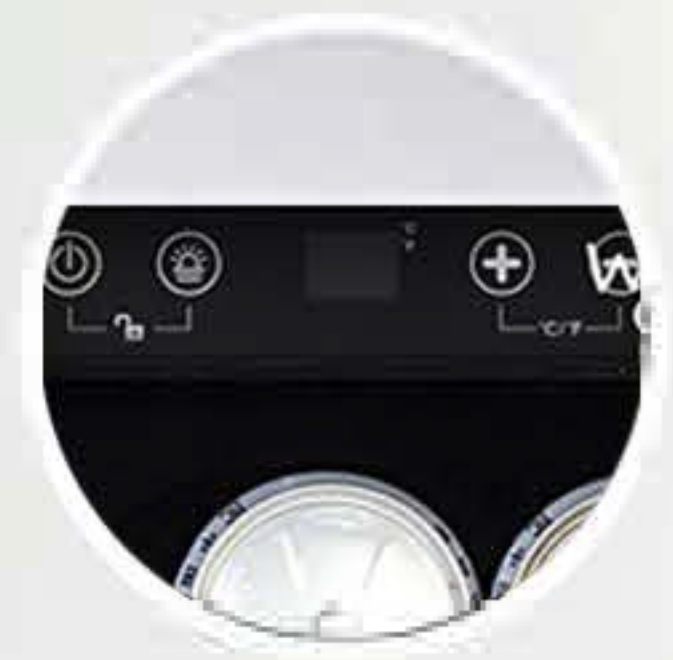
TOUCH SCREEN CONTROL