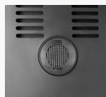
ACTIVATED CHARCOAL FILTER