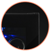
FULL GLASS DOOR