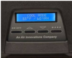
Fig. A (TTW)