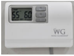
Fig. B (Ducted)