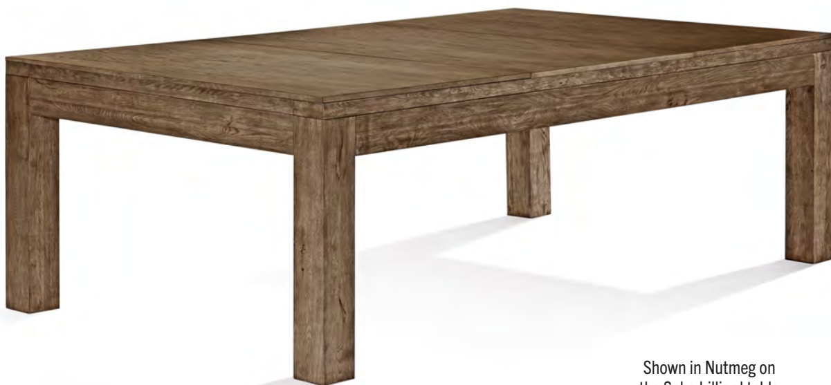
Shown in Nutmeg on the Soho billiard table

A practical addition to a Brunswick Billiards 7' or 8' table, these dining tops convert your 7' or 8' billiards table into a dining table, conference table or an arts & crafts room. The dining top comes in three pieces and is available in five colors for the 8' option and two colors in the 7' option. ( Note: Dining tops will not fit all Brunswick Billiards table models. )