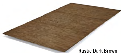
Rustic Dark Brown