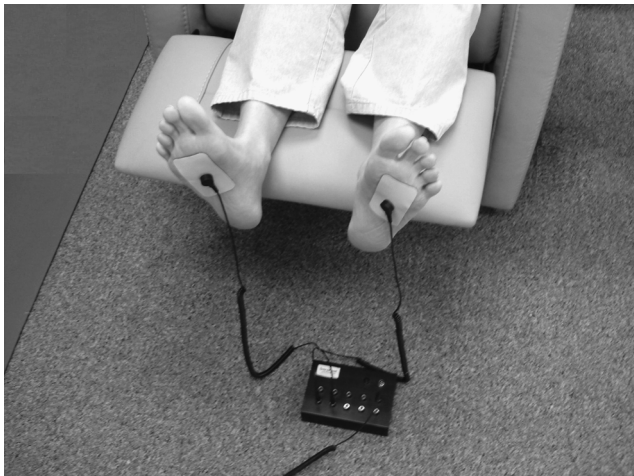
FIG. 1. Grounding system showing patches, wires, and box connecting to a ground rod planted outside through a switch (not shown) and a fuse (not shown). Similar patches and wires from the hands were also connected to the box to ground the hands.

(Fig. 1). The grounding system itself consisted of a 100-foot-long (30.48 m) ground cord connected to the box on one end and attached to a 12-inch (30.48 cm) stainless steel rod planted in the earth outdoors at the other end. Another box with a switch in between both ends of the grounding cord was used to cut or establish the connection with the earth. The switching box was placed in the control room. The ground cord contained an Underwriters Laboratories–approved 10-mA fuse.