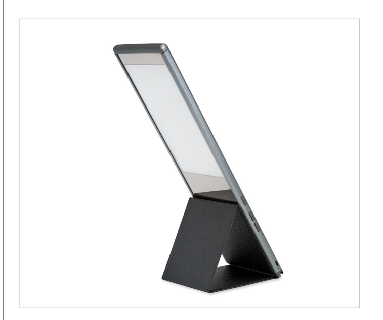
Journi<sup>®</sup> Mobile Task Light: The JOURNI portable circadian LED light gives you the best of our popular, healthy spectrums in a sleek, low-profile and portable device—perfect for students, travelers or anyone on the go.

SunTrac <sup>**</sup> Ecosystem: Combines all SunTrac-compatible products with SunLync<sup>**</sup>, automating lighting to give the proper light at the right time of day. More controls, such as our SunTrac wireless switch and App make manual adjustments easy with just the press of a button.