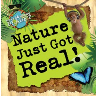
Podcast cover-300 dpi