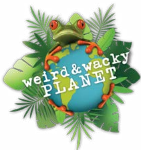
WWP Logo-300 dpi