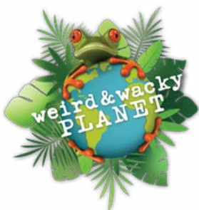
WWP Logo-96 dpi