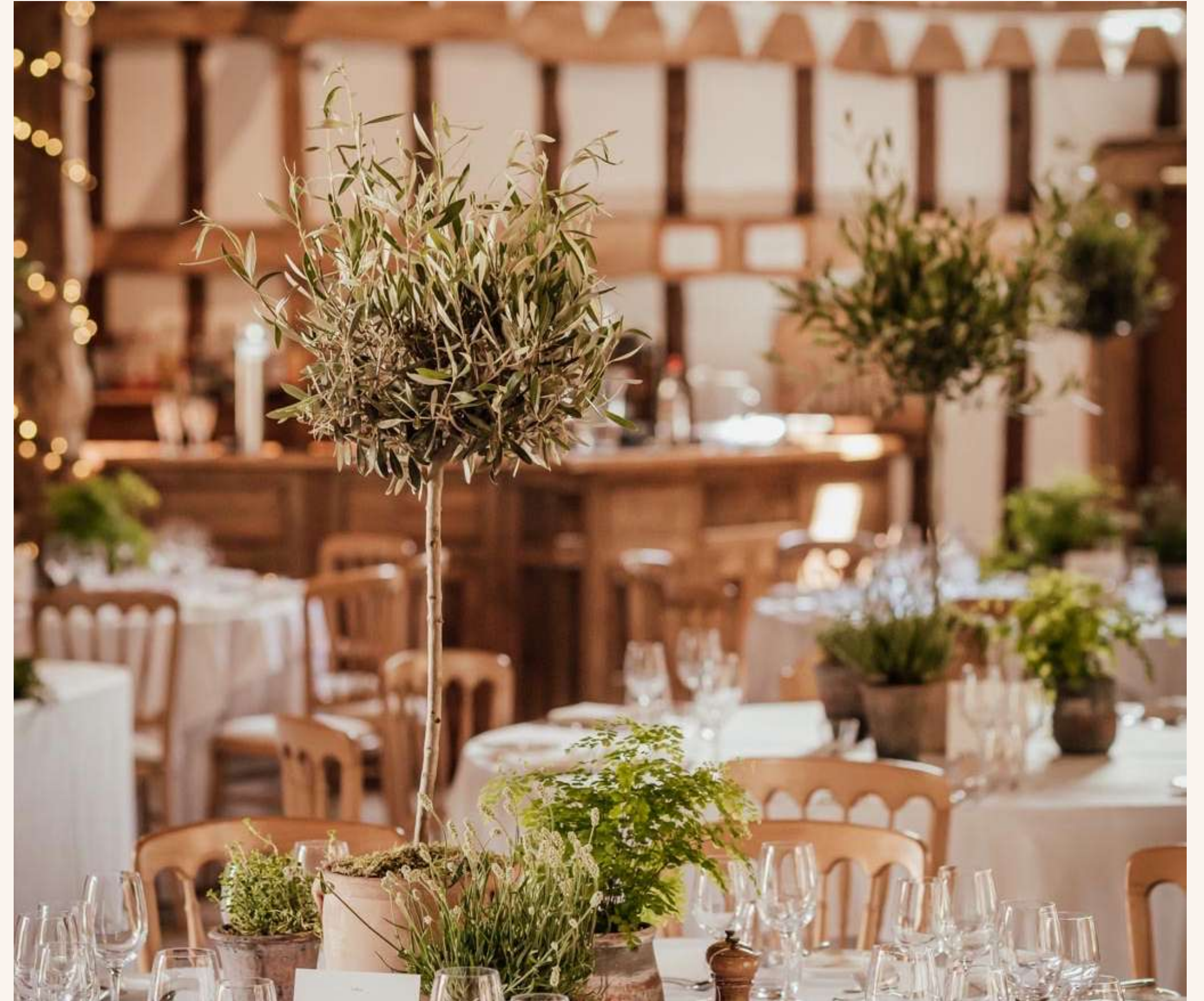
Clock Barn, Whitchurch