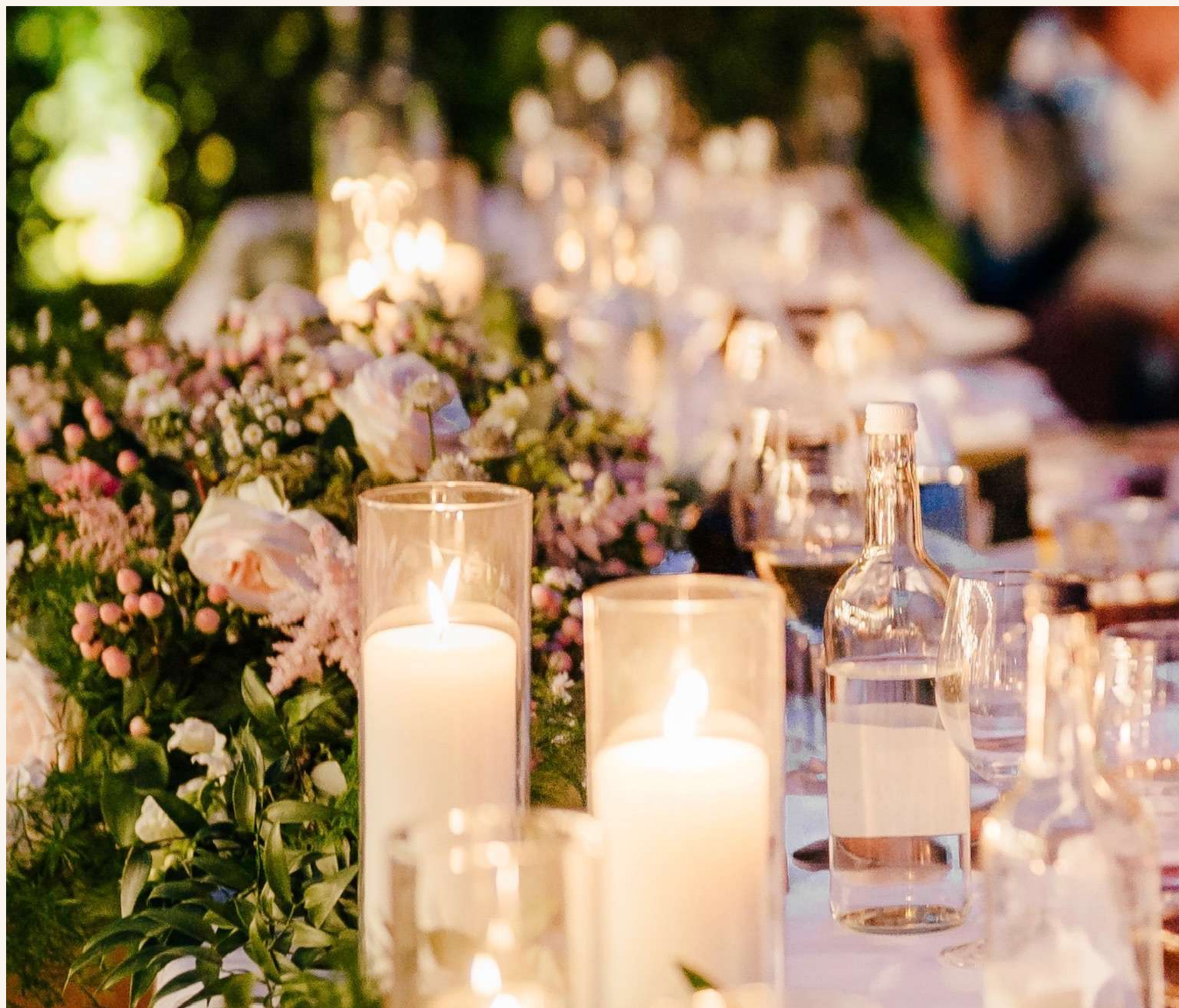
Hotel du Vin, Winchester