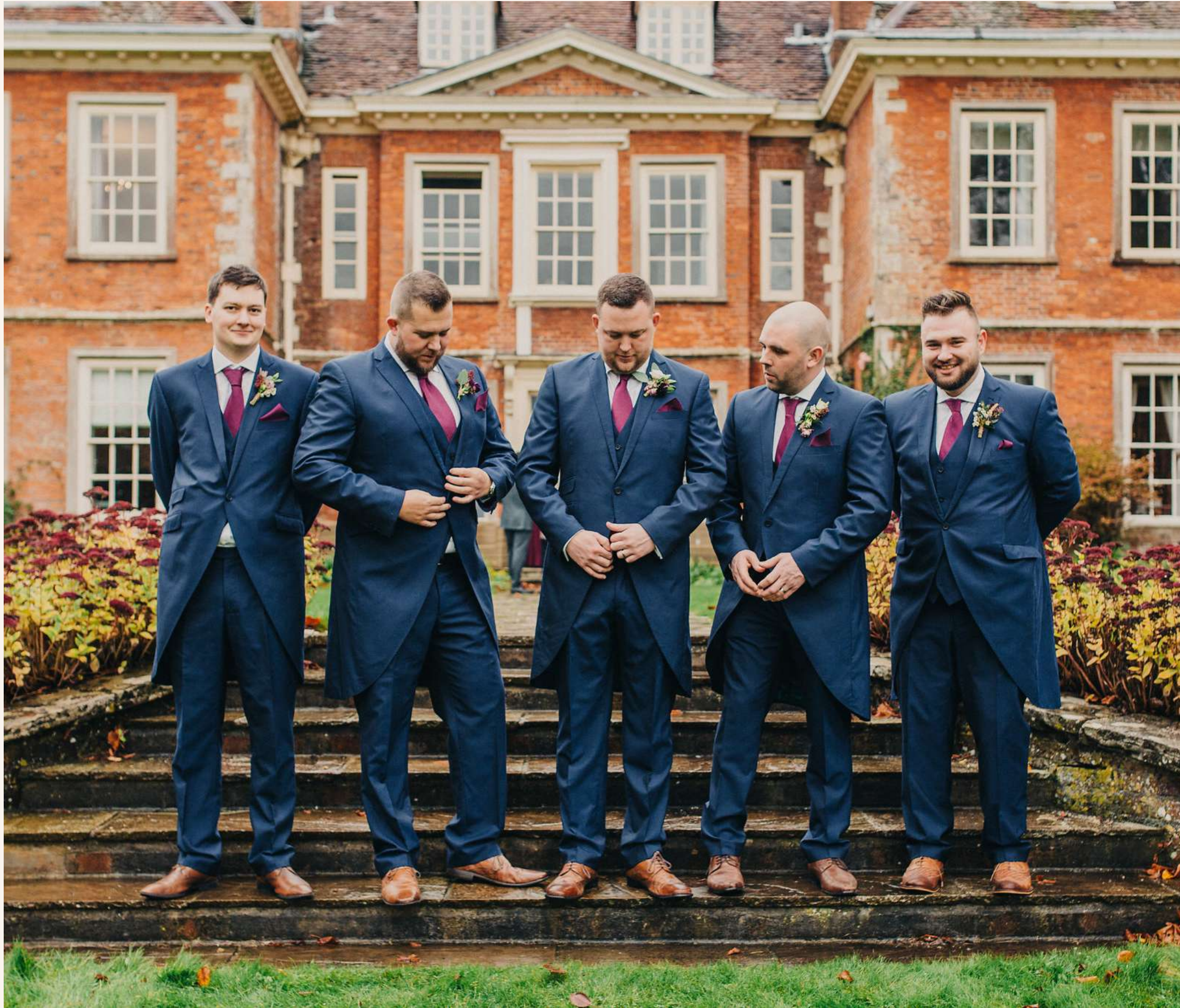
Lainston House, Winchester