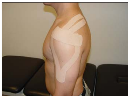
FIGURE 2. Therapeutic Kinesio Tape application.