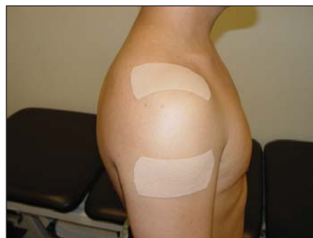
FIGURE 3. Sham Kinesio Tape application.