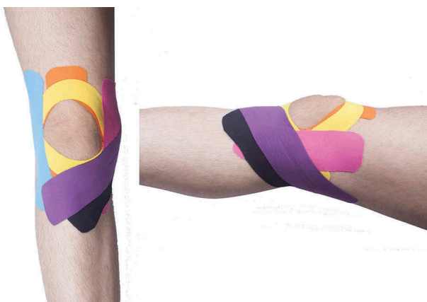
Figure 2. Kinesiotaping of knee joint for pes anserinus tendino-bursitis with space-correction technique.

The kinesiotaping was applied for 3 weeks over the tender area with space-correction technique. As shown in Figure 2, the space-correction (lifting) technique was used to create more space directly above the area of pain and swelling. The increased space created reduces pressure by lifting the skin away from the injured site. Kinesiotaping was repeated three times with a 1-week interval. Another group received treatment with naproxen (250 mg TID for 10 days) and 10 sessions of daily physical therapy. The physical therapy was applied for all patients by one physiotherapist with use of hot pack, TENS, and phonophoresis. All of the participants were advised to have a relative rest and reduce the strain on the injured knee, avoid climbing stairs, prolonged knee flexion position of less than 90°, and other irritating activities. In each session, the adherence of participants to these instructions was monitored and reminded by physiotherapist.