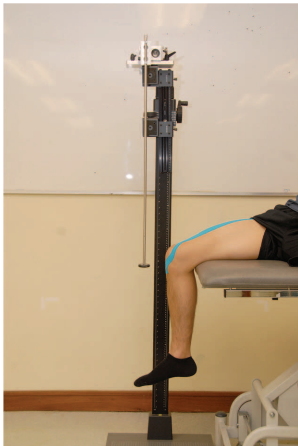
FIGURE 2. Subject and the reflex jig positioned for testing.

The knee extensor peak torque was evaluated using isokinetic dynamometer (Cybex Humac Norm, CSMI version 2.04, Stoughton, MA, USA). The subject was seated in the dynamometer chair with the hips in 85° flexion and the knees in 90° flexion. The knee joint was aligned with the axis of the dynamometer. The subject's torso and the thigh were firmly