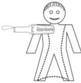
Front scanning(figure 3)