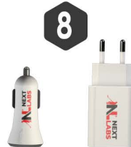
car & home chargers