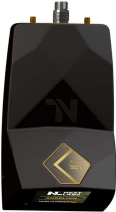
Device main unite