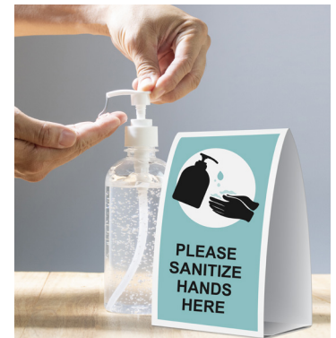
Washable table tent

For more information about REVLAR, visit: relyco.com/products/synthetic-paper