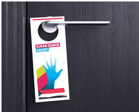
Cleanable door hanger