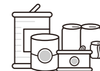
Metal & Aluminum