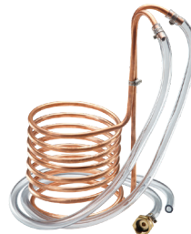
Immersion Wort Chiller

Go to www.brewersbestkits.com to find a retailer near you.