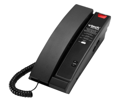
CTM-S2213-LOBBY (Matte Black) 1-Line Contemporary SIP Corded Petite Lobby Phone