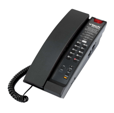
CTM-S2213 (Matte Black) 1-Line Contemporary SIP Corded Petite Phone