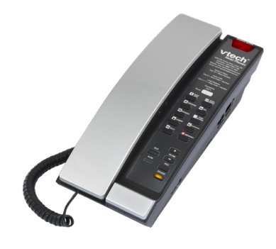
CTM-S2213 (Silver & Black) 1-Line Contemporary SIP Corded Petite Phone