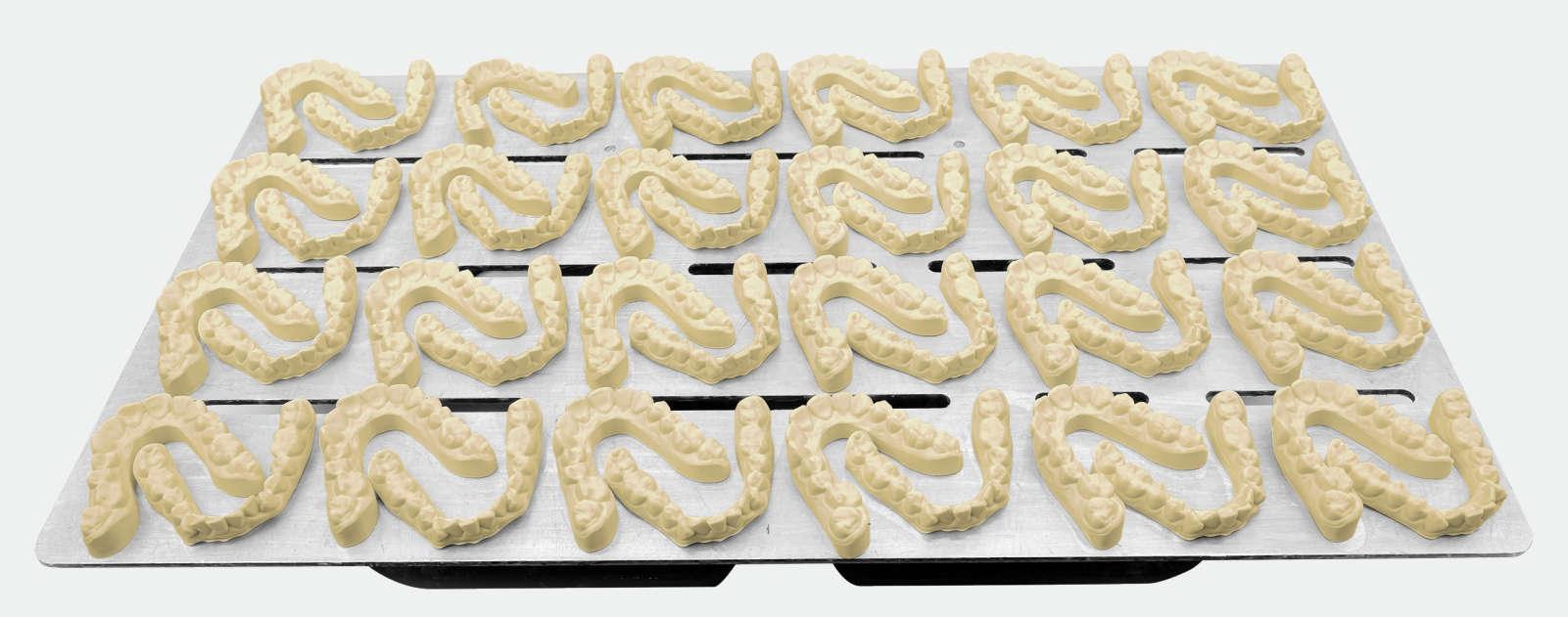
Magna Platform pictured shows 48 x Aligner Models

Photocentric Magna Dental Model Beige has been specially created for 3D printing highly detailed and accurate dental models. It provides outstanding accuracy with at least 90% of scanned models within \pm 100 \mu m tolerance, perfect for Aligner Dental Model production. Using Magna Dental Model Beige ensures a dry surface finish, accurate detail and great mechanical stiffness, shorter print and post process cycles with a high Shore hardness of 84D.